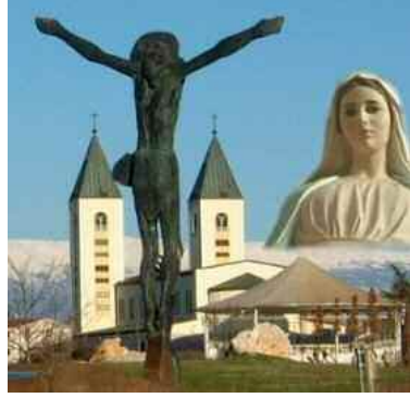
2 Full Weeks - 16 Days Oct 15-31, 2010

7 days/8 nights in Medjugorje plus 4 days/5 nights in Northern Croatia Highlighted by Private Viewing and Veneration The Eucharistic Miracle of 1411