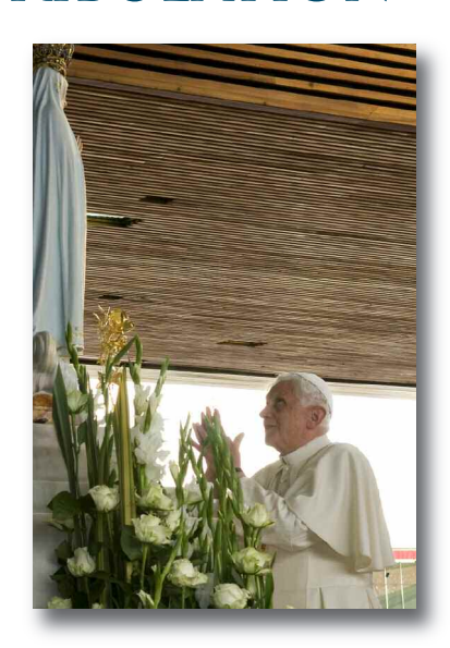
Pope Benedict XVI in Fatima

Today books are being written by Catholic, Jewish and Protestant authors predicting an imminent catastrophe for the whole world as a result of man's refusal to obey the laws of God. All three groups use biblical references to prove their thesis. The Catholics also cite private revelation from LaSalette, 1846; Lourdes, 1858; Fatima, 1917; and other approved apparition sites as well as those still being investigated, such as Medjugorje and Garabandal.