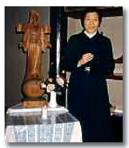
Sister Agnes Sasgawa to Bleeding Statue of the Blessed Mohther

"The work of the devil will infiltrate even into the Church in such a way that one will see cardinals opposing cardinals, bishops against bishops. The priests who venerate me will be scorned and opposed by their confreres...churches and altars sacked; the Church will be full of those who accept compromises and the demon will press many priests and consecrated souls to leave the service of the Lord."