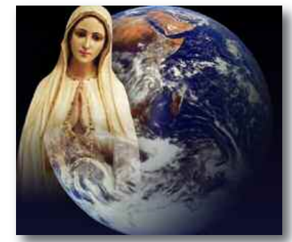
The Marian Age

"As I told you, if men do not repent and better themselves, the Father will inflict a terrible